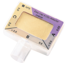
COLOR RANGE "C"