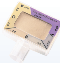
COLOR RANGE "B"